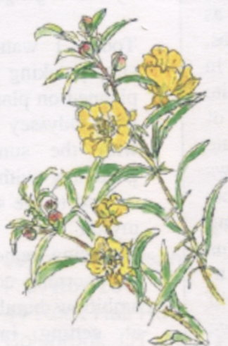
YELLOW SNOWDROP Calylophus serrulatus - CHANDRACAR - CHANDRACAR - CHANDRACAR - CHANDRACAR - CHANDRACAR - CHANDRACAR

our plants the best chance of surviving the unpredictable weather we face here in New England.